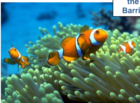
Anemone fish guarding their coral home on the Great Barrier Reef