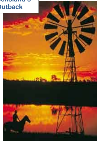
A spectacular sundown in Queensland's Outback