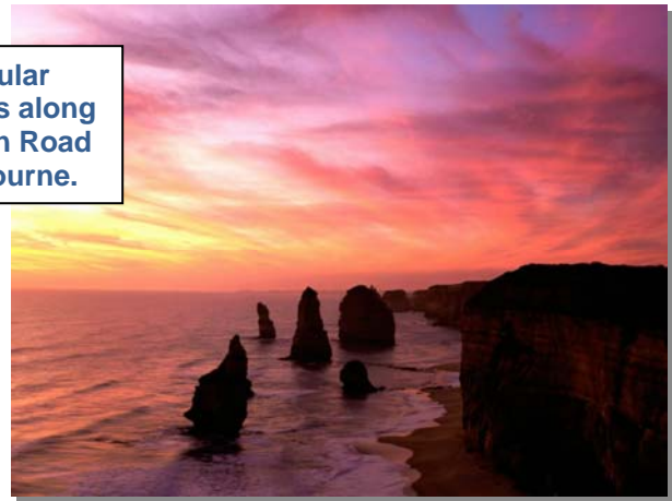
The spectacular Twelve Apostles along the Great Ocean Road south of Melbourne.

The Twelve Apostles are situated 230km from Melbourne, on the Great Ocean Road. These are huge stone pillars that soar out of the ocean creating spectacular coastal scenery.