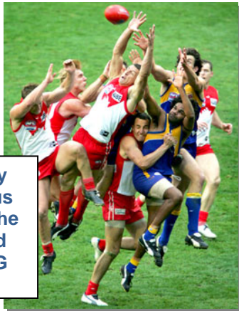
Swan Leo Barry takes the famous saving mark in the 2005 AFL grand final at the MCG

Easily reached by tram, a 25-minute journey from Melbourne's CBD, St Kilda is renowned for its picturesque bayside setting, close proximity to the city, beaches, music venues, restaurants and cafe lifestyle. Its is also home to Luna Park, a historic fun fair that is one of Melbourne's best known landmarks.