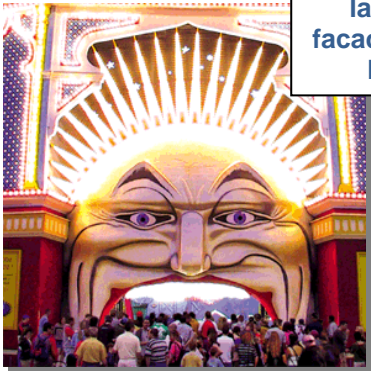
The famous laughing face facade of St Kilda's Luna Park.